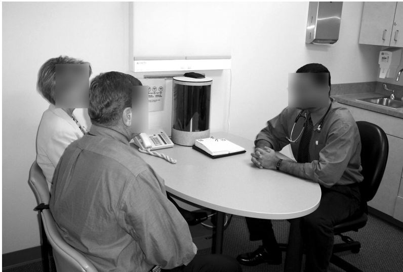
Figure 1. Camera cylinder recording a patient–physician–family member interaction.

terminated early or destroyed). Research assistants obtain consent to videotape the interaction from the patients and their family members/companions before they enter the examination room. (Only one patient has rescinded his informed consent after seeing the equipment.) Patients usually observe the placing of the cylinder on the table.