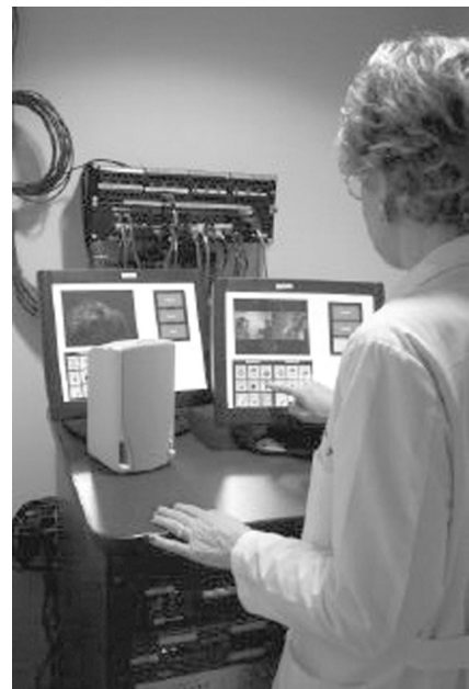
Figure 2. Crestron LCD panel for monitoring interaction and controlling cameras.

The combined audio, video, and control signals sent over the connection provide separate views of the physician and the patients/family members and are simultaneously recorded on tapes inserted into two separate digital videorecorders. Because two views of the interaction are recorded with separate cameras, a time-code generator and time-code reader automatically insert synchronized running time codes on both tapes for later side-by-side viewing of the session on a computer monitor. The time code provides a continuous display of